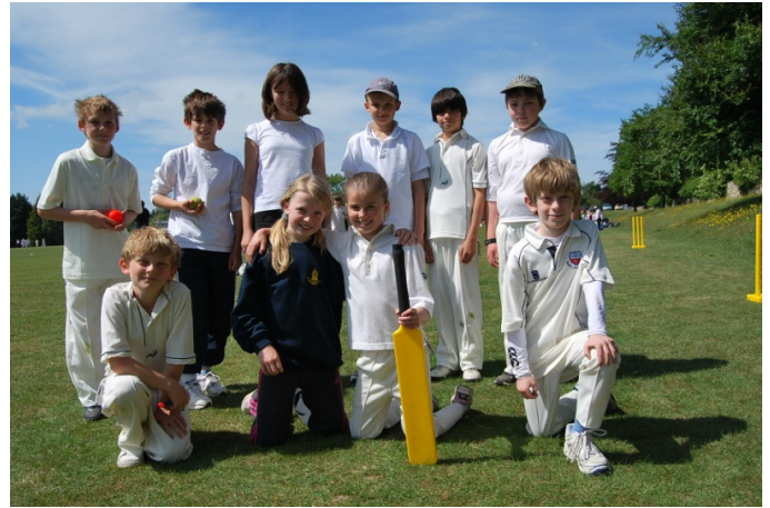
Kwik Cricket @ The Sulis Club

On Wednesday 25 th May the school cricket team took part in the interschool Kwikcricket tournament which took place at The Sulis Club. It was a beautifully sunny day with a dry pitch. The team played well, and there were lots of exciting games. We played five games in the first round of the tournament; winning one and losing four.