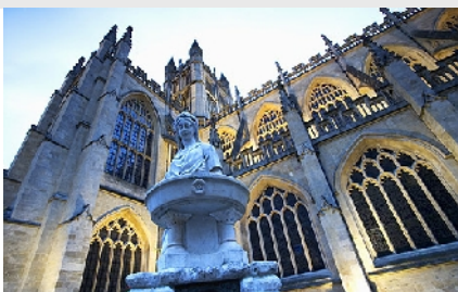
Bath Abbey Soloists