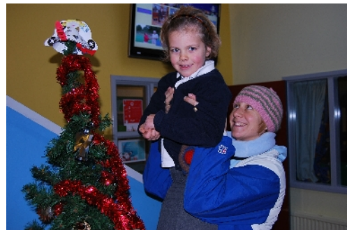
The Christmas Angel goes on top of the tree!

Happy Christmas and New Year from all the staff